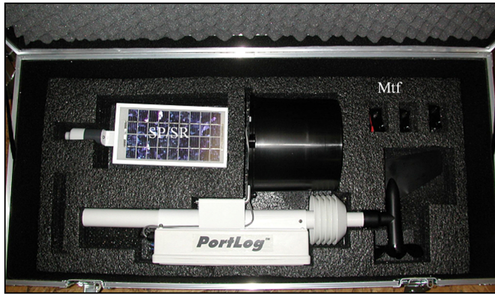
Standard unit in travel case