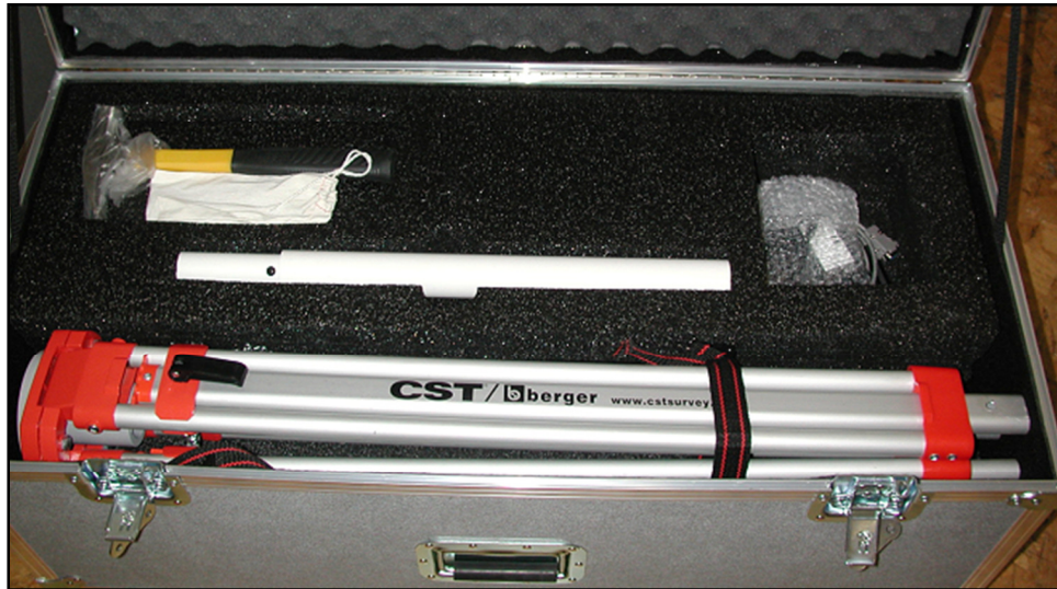
Tripod in travel case

The PortLog is stored under the tripod and foam. The other accessories are located in the well. The top is cushioned to support the items when the cover is closed.