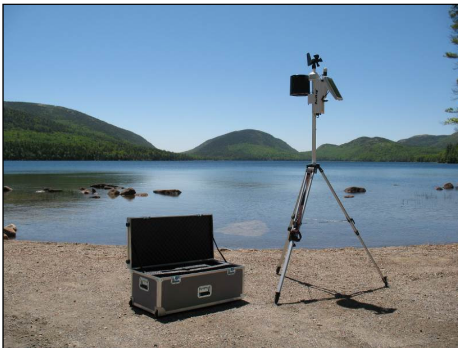
Deployed PortLog with tripod and travel case

The PortLog communicates directly to a PC via an RS232 serial port. During the data logging time interval, the wind speed and wind direction are averaged. The maximum wind speed is also captured and the solar energy calculated. All data is saved to non-volatile RAM. Selectable units are English and Metric with wind speed also recorded in Knots and Meters per Second. Solar Radiation is in SI units only.