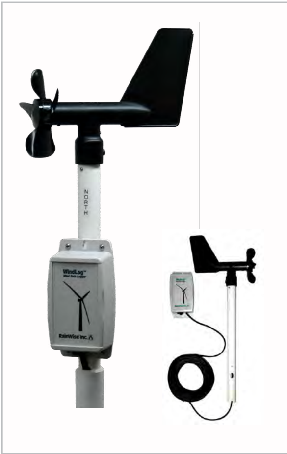
WindLOG™ & WindLOG™-XT-50 with 50' Extension Cable